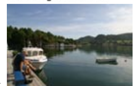
Bryggeprat i Sjernarøyane

• Nord-Talgje in Sjernarøyane archipelago: The area consists of islands, skerries and islets, sounds and many sheltered coves – a popular boating destination with space for everyone. Den blå lagune (“the blue lagoon”) is a great place to swim for children, too. A nature reserve was established at Nord-Talgje in 2004. Facilities include a toilet, mooring hooks, waste disposal and recycling station, and an information board. Accommodation is available at Eldhuset bed & breakfast at Nord-Hidle near Hildesundet sound. Good traditional local food is served at Eldhuset and at Sjernarøy Maritim. Sjernarøyane archipelago has many excellent areas for hill walking, with well-marked paths on Kyrkjøy, Bjergøy and Nord-Talgje islands. Lundavågen has a nature reserve, and at Lundaøya you can visit Finnborg, remnants of ancient rural fortifications that offered protection in more hostile times.