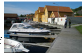
Gjestehavn Judaberg

and a sound that offer many tempting places to cast anchor. Facilities in the area include handicap toilets, waste disposal and recycling station, guest harbour, and marked trails where you can enjoy birdlife, and see wildlife and free-ranging sheep. Accommodation is available at Finnøy Fjordsenter (on the eastern shore of Finnøy, at Nåden, south of Judaberg), where there are cabins and camping with sanitary facilities and other amenities. In Judaberg you can re-fuel 24 hours a day with credit card or bankcard.