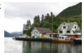
Erøy Landhandel

• Skaholmen Berget on the Økstrafjord (Suldal): The beacon at Barkeneset shows safe sailing into the Økstrafjord. Skaholmen Berget lies on the western shore, an area with polished and sloping rockfaces, idyllic islets, promontories, coves and sounds. There are